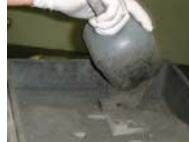
Cover "green" part and bronze infiltrant with alumina powder