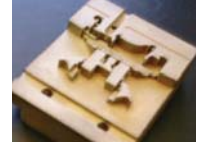
Post-finish, as necessary