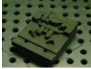
Build "green" part