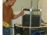
Place into oven to debind and infiltrate